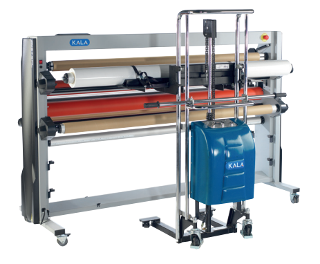
For roll lifters, ask us about our RollJack